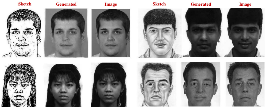
Near-future uses include generating a photograph-like image of a person from a sketch.